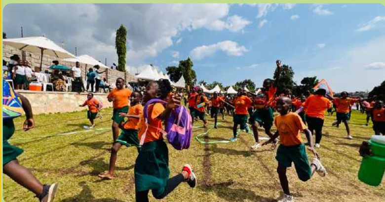
Kirimanjaro House- The Winners. Game on, we own the throne.